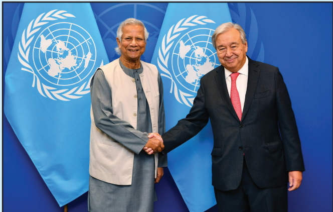
Hon'ble Chief Adviser Professor Muhammad Yunus Meets UN Secretary General Antonio Guterres at UNHQ