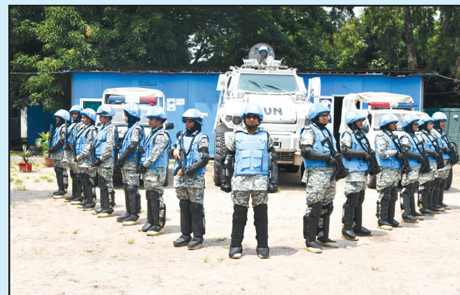
Bangladesh Police performing QRF Duty in Kinshasa, DR Congo