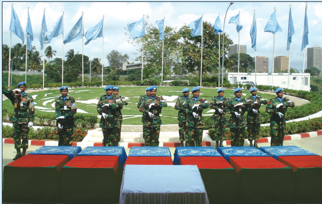
Homage to the Martyr Peacekeepers of Bangladesh