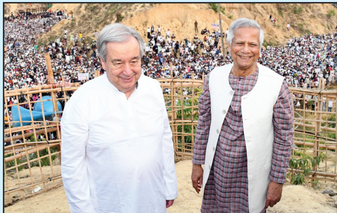
Hon'ble Chief Adviser Professor Muhammad Yunus and UN Secretary General Antonio Guterres Visiting Rohingya Camp