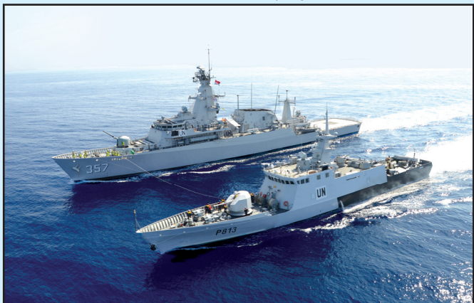
Bangladesh Navy Ship carrying out Joint Exercise with Indonesian Ship in the Mediterranean Sea, UNIFIL, Lebanon